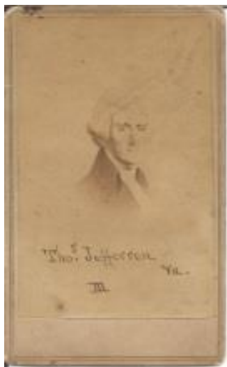
Thomas Jefferson (1743-1826)

As the 1804 election approaches, Jefferson and the Democratic-Republicans discard Aaron Burr as their Vice-Presidential candidate in favor of former General George Clinton, now sitting Governor of New York.