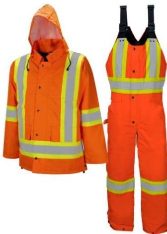
ORANGE WINTER TRAFFIC PARKA PAIRED WITH ORANGE WINTER TRAFFIC OVERALLS