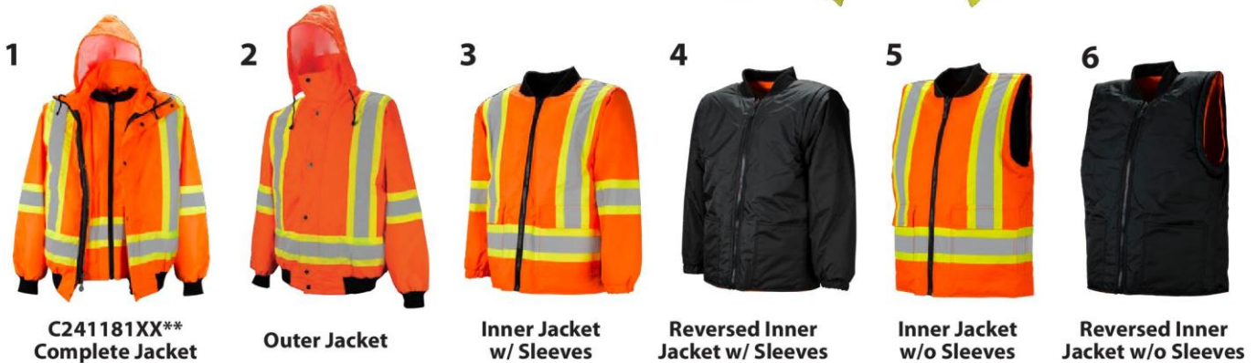
C241181XX** Complete Jacket