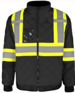
BLACK QUILTED FREEZER JACKET

The Canadian Standards Association's High Visibility Safety Standard - CSA Z96-15 - covers two garment design elements. The layout of reflective striping and luminance of background fabric determine three Classes of safety.