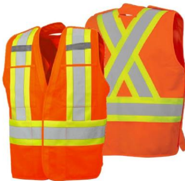
ORANGE TRAFFIC SAFETY VEST