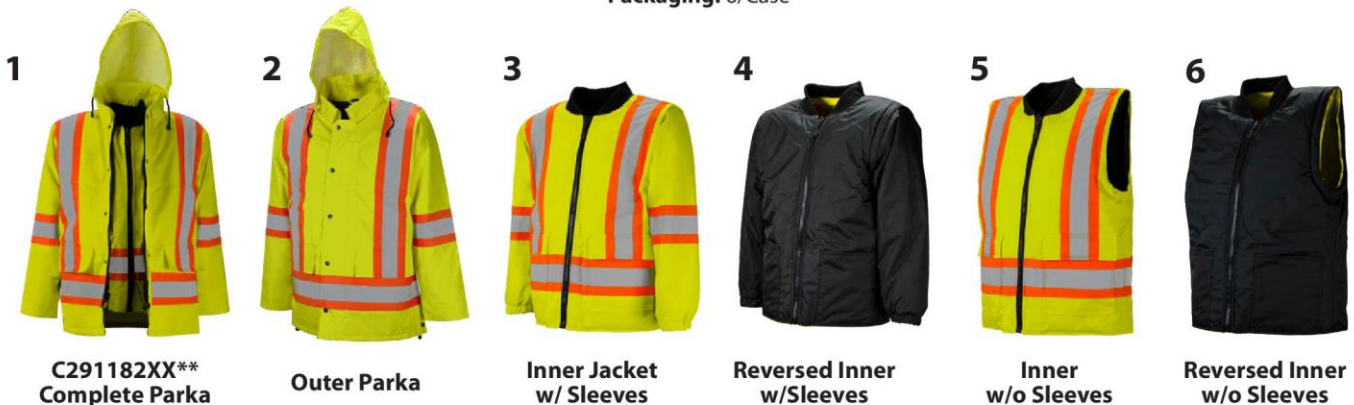
C291182XX** Complete Parka