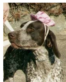
LucyLu's summer fashion Her pink camo hat