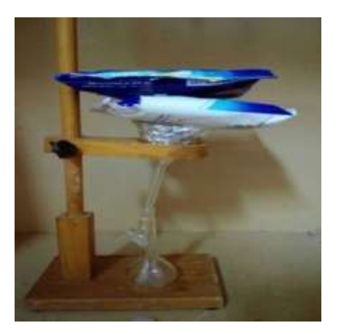
Fig. 1. cold shock setup

Nandhitha Madhusudhan et al [20] reported that the best method for isolation of coelomic fluid shows greater recovery by cold shock when compared to other methods such as heat shock method and electric shock method. When the earthworms were subjected to cold shock method, the essential proteins as well as enzymes were not prone to denaturation as in heat shock and electric shock, which may be the reason for the higher cell density observed.