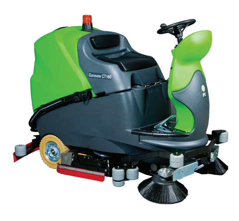
CT160 BT75 R Cylindrical Brush, Scrub & Sweep Version