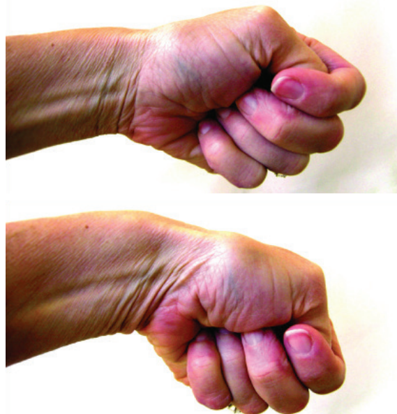
Figure 2A and 2B: Pain with this motion (a hammering motion with the thumb in the fist) is characteristic of de Quervain's Tenosynovitis.

If these less-invasive options have not provided relief, surgery to open the tunnel and make more room for the tendons may be considered. Discuss the best treatment option for you with your hand surgeon.