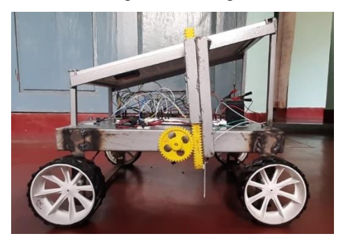
Figure 3: The prototype of the Agribot

An Agribot is built which tests the moisture content of the soil in the designated sensing nodes and takes an action on