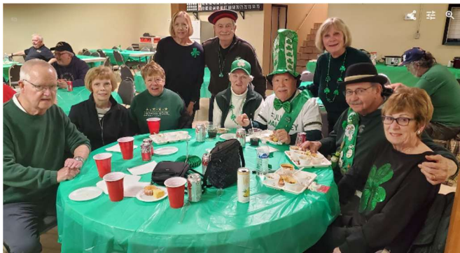
Rochester PD Support Group showed up in full Irish regalia to join in the fun.