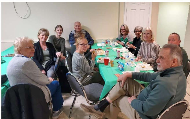
Rock Steady Boxing family and close supporters of Veterans