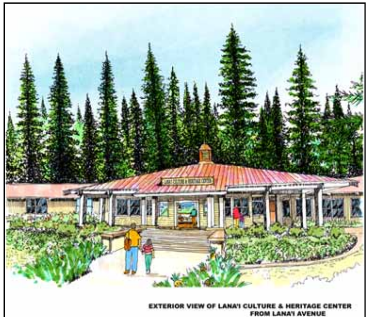
EXTERIOR VIEW OF LANAI CULTURE & HERITAGE CENTER FROM LANAI AVENUE

Renovations to begin soon for new Lāna'i CHC facility in Rooms 118 & 124 of the old Dole Administration Building. Work is expected to be finished in December 2009.