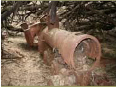
The Maunalei Sugar Co. Locomotive, "Waiahole," originally built in 1882, and brought to Lāna'i in 1899 (KPA-C12001).