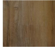
California Almond MED-01795