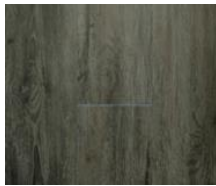
Warm Leather MED-01788