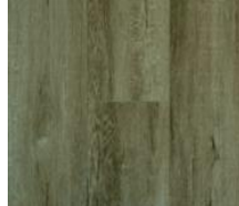
Rustic Grey MED-01789