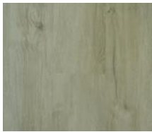
Country Taupe MED-01786

(5.5mm) x 7" x 48" with 20 mil/0.050mm Urethane Wearlayer 100% Virgin PVC Backing and WPC Core, 870 psi, Phthalate Free 23.64 square feet per carton, 4-Sided Bevel with Unilin Angle/Angle Lifetime Residential & 10-year Light Commercial Limited Warranties