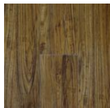
Warm/Rich Earth MED-01798