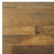
Cabin Whiskey MED-02070