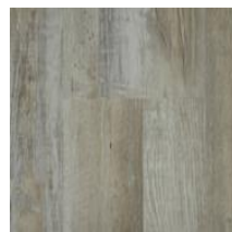
Pearly Grey MED-02072