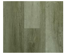
Offer Grey MED-01796