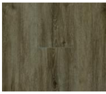
Modern Pecan MED-01787