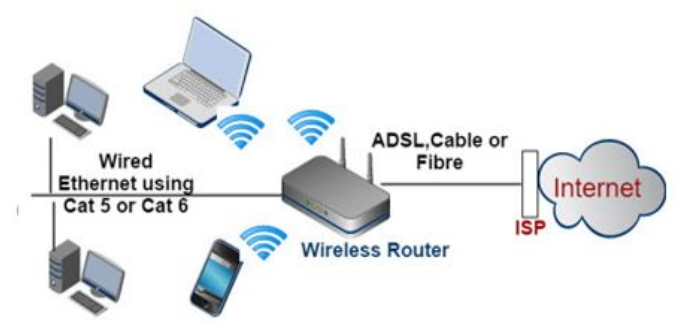
Fig.2: Network Diagram Typical Simple Home Network