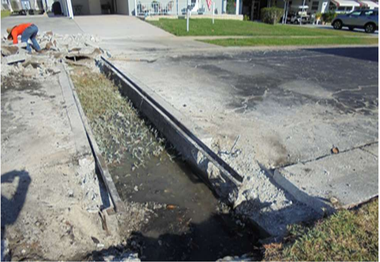
Village street gets facelift with new grates to be installed