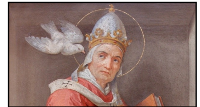
Feast Day: September 3