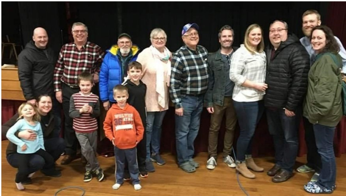
2020 First Place Trivia Team