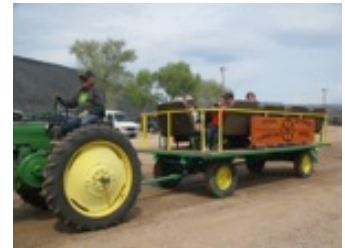
Jim Mager / people mover