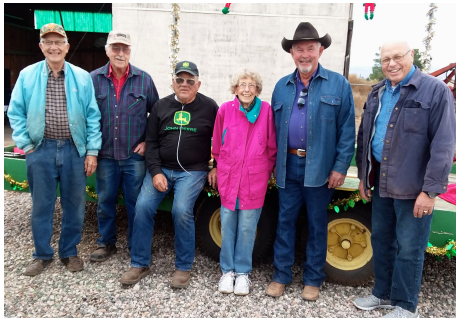
Christmas Parade Float decoration Volunteers