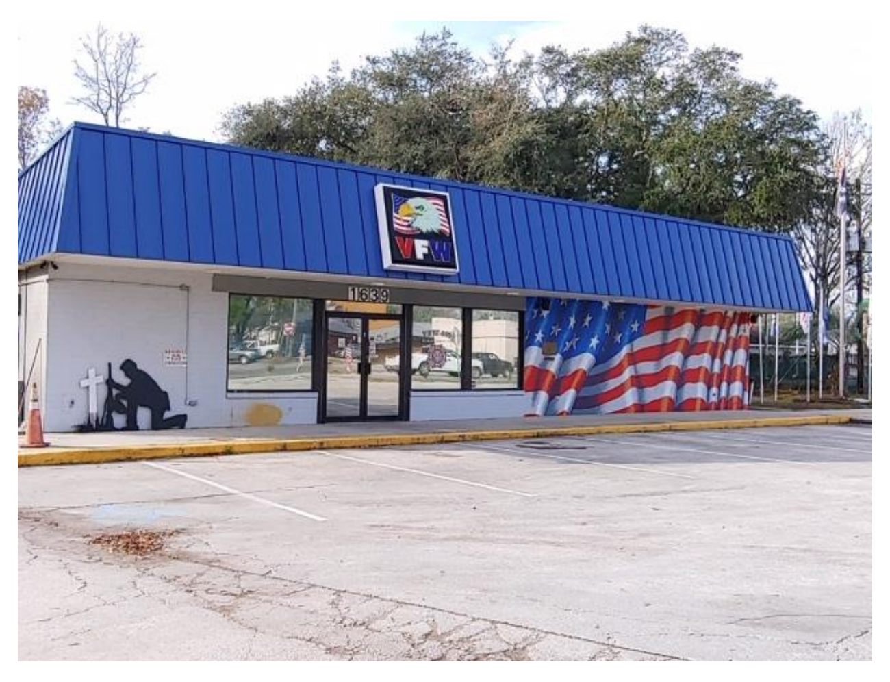
Your Post after completed outside repairs, the inside looks just as great, thanks to the many of you that contributed.