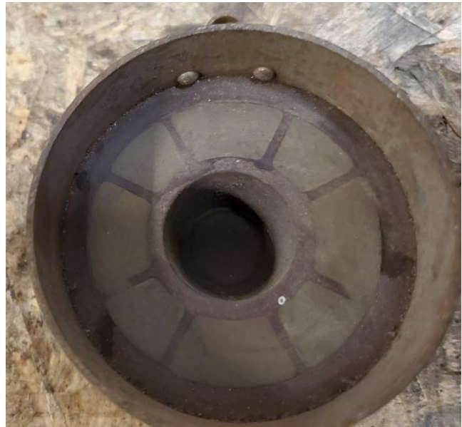
The brush or roller seems to be missing from the unit