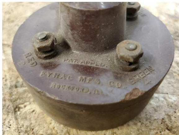
From this angle the lettering clearly shows ROCKFORD, ILL. and includes the color code for connecting the wires.