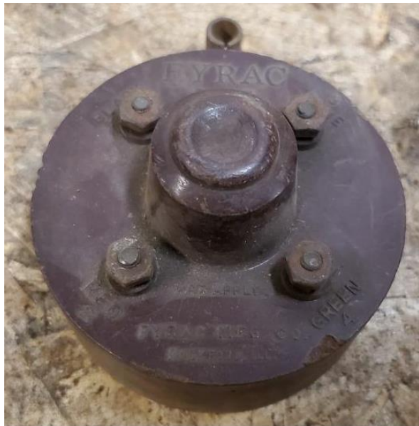
A Fyrac timer listed for sale on Ebay

At one time there were over 300 brands of Model T timers on the market, according to Tim Wanfalt, who has an extensive collection of them. Fyrac was one of those brands. The Fyrac spark plugs have a very uniquely designed, elongated electrode offering one inch of firing surface, according to their vintage advertisements. Additionally, the ads stated the plugs could withstand 150 psi of pressure without leakage. Fyrac's Night Guide windshield spotlight was also a popular accessory for Model T's and Model A's.