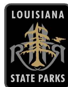
LA Parks & History