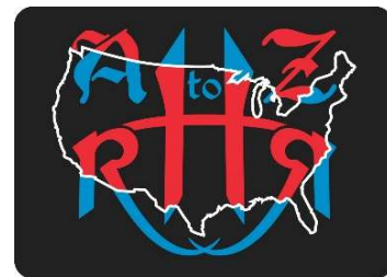
U.S. Cities A to Z