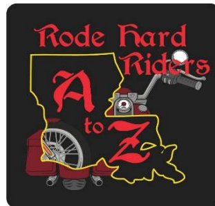
LA Cities A to Z