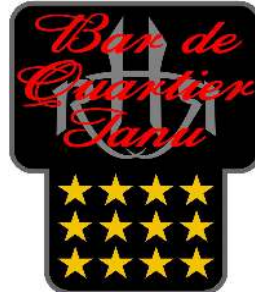
Bar de Quartier Tanu