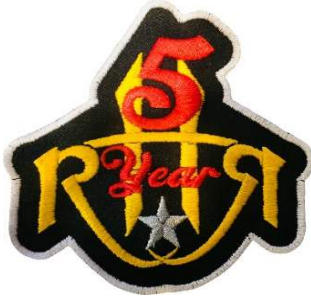
5 Year Member