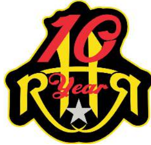
10 Year Member