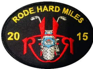
Rode Hard Miles