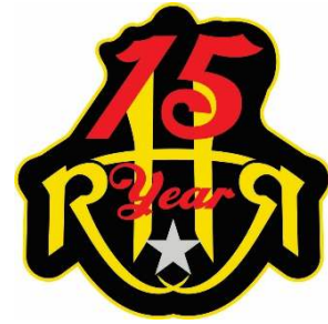
15 Year Member