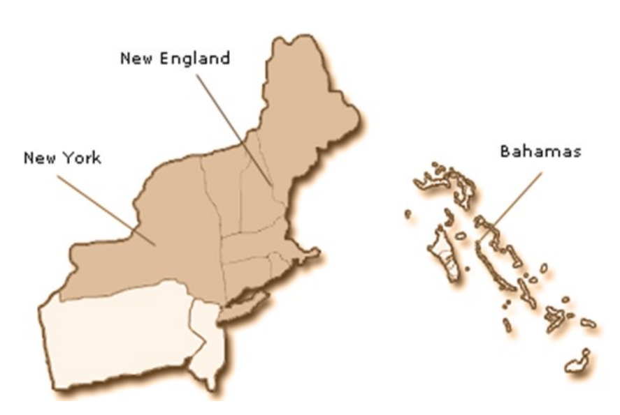
North Eastern Episcopal District.