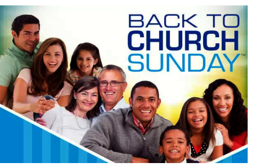
September 18, 2016

I knew it! I knew it! I knew it! Adults. Even as a five year old boy growing up in a suburb of a city in Ghana, West Africa, I had my suspicion of adults. I