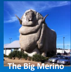
The Big Merino