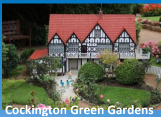
Cockington Green Gardens