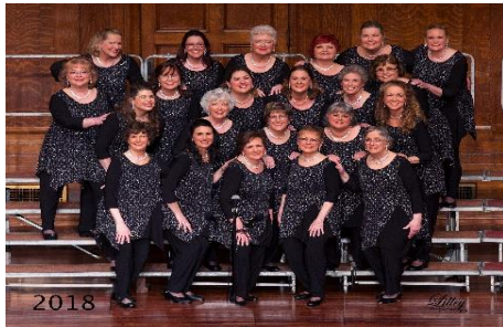
Northern Voices A Cappella Friday 5pm at the Farm Museum