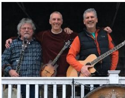
The Sidewalk Boys Saturday 2:30pm at the Farm Museum