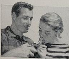
© LIGGETT & MYERS TOBACCO CO.

Only L&M gives you the full, exciting flavor of today's finest tobaccos through the modern miracle of the Miracle Tip!