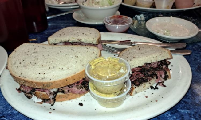
This was my take home