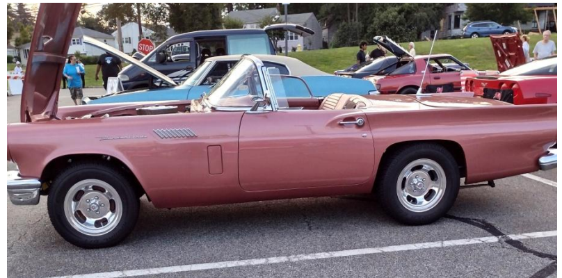
Gerry Ingersoll's 57