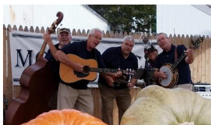
Monadnock Bluegrass Band