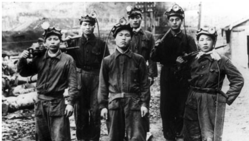
Korean coalminers in Sakhalin

In recent years the Japanese government, quietly and on "humanitarian grounds," has helped fund the repatriation to South Korea of some Sakhalin Koreans, more than 40,000 of whom endured a harsh Cold War existence as "stateless persons" on the island controlled by the former Soviet Union. As many as 150,000 Koreans were brought to Sakhalin between 1910 and 1945, many of them to work in Japanese coal mines and lumber yards. The latest repatriation efforts are described by the Korean Overseas Information Service in the article below. (Background information on the difficult history of Sakhalin's Koreans can be found at Wikipedia .)