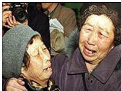
Repatriates to Korea from Sakhalin

Incheon is one of several residential areas currently available for the Sakhalin Koreans, along with those in Seoul and Ansan. The returnees are entitled to a monthly government allowance of about 400,000 won ($425) per person if they have no income.