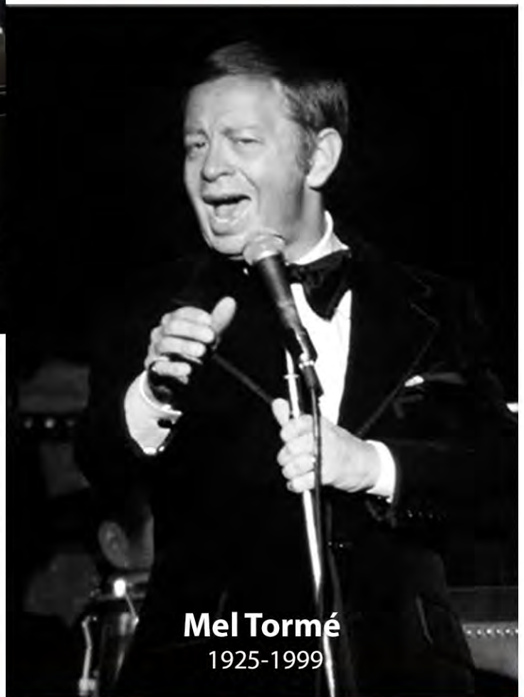
Mel Tormé 1925-1999