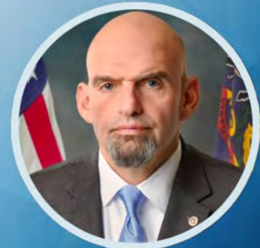
KEYNOTE SPEAKER SENATOR JOHN FETTERMAN

BROWARD COUNTY CONVENTION CENTER 1950 EISENHOWER BOULEVARD FORT LAUDERDALE, FL 33316