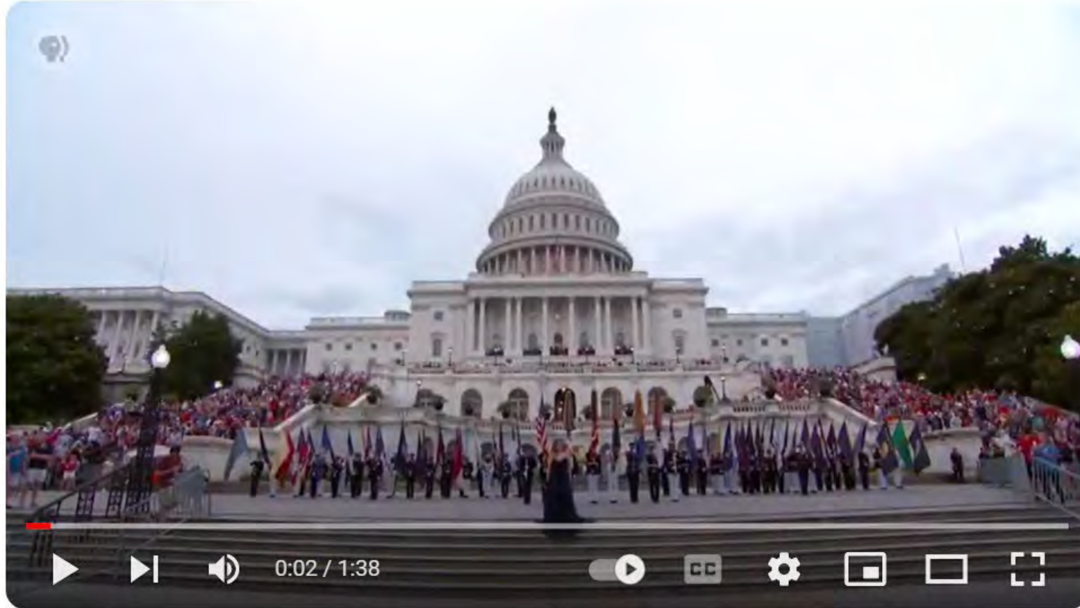
Maelyn Jarmon performs "Star Spangled Banner" at the 2019 A Capitol Fourth