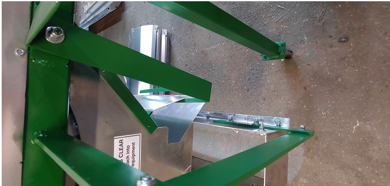
Flip Door Closed, Slide Plate Removed