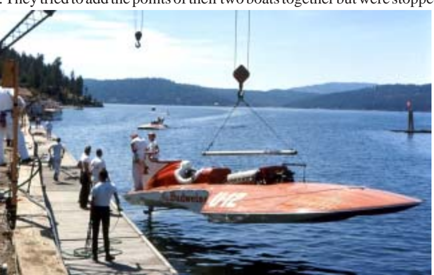
The new U-12 Miss Budweiser (4) being launched at Lake Couer D'Alene.

The Budweiser and Smirnoff teams had both tried to get this rule changed, as they each ran two boats because of