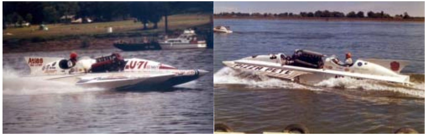
The Atlas team had wrecked their primary hull (#7171) before the 1974 season. They ran #6880 as the U-71 Atlas Van Lines (6) for three races. The primary returned and finished the season. The #6880 ran as the U-44 Atlas Van Lines II (2) at Detroit then as Pizza Pete and Gale's Roostertail. Above left, Atlas Van Lines (7), at right Pizza Pete at Tri-Cities. ~ both H&RM Collection photos

In 1976 a first happened in unlimited hydroplane racing. One team leased out a hull for a couple of races. In 1976, both the Olympia Beer and Miss Budweiser teams leased boats for two or three races while their primary hulls were repaired. The Olympia team leased the U-7 (#7571) for two races after Billy Schumacher wrecked #7474 at Detroit's Gold Cup. Bottom left is the repaired U-74 Olympia Beer at Tri-Cities. At right is the former U-7 as the U-74 Olympia Beer (2). ~ both H&RM Collection photos