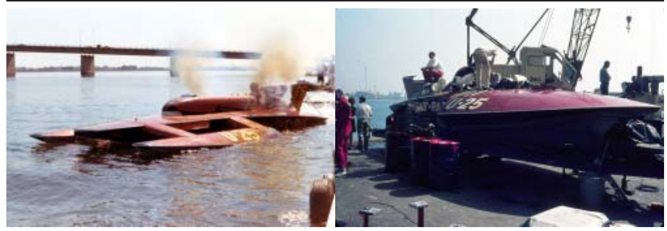
In 1969, the Pay 'N Pak team ran two boats: the outrigger (what a sad flop that was) in the first six races and the new conventional (future Li'lBuzzard) in the final event. [The UU stats scored the hulls separately. Officially the totals might have been combined.] ~ Above left is the U-25 Pride\ of\ Pay\ 'N\ Pak\ (1) outrigger at Tri-Cities. At right is the U-25 Pride\ of\ Pay\ 'N\ Pak\ (2) in the pits at Detroit.