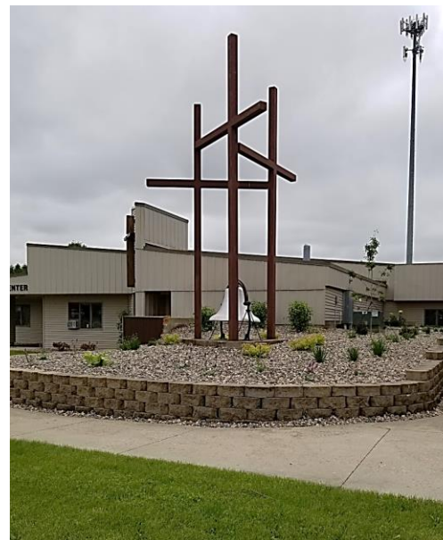
New Landscaping 2019