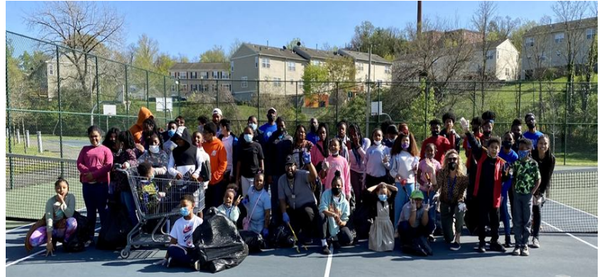
WTEF Students participate in Earth Day Clean-Up at our East Campus!