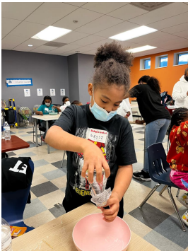
CFE Students participate in STEM Engagement Series Baby Scientists!

Our student athletes celebrated Howard University Tennis as a part of our community by enjoying a meet and greet with the team before watching their match.