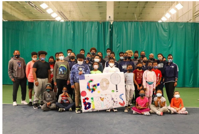
WTEF Students with Howard University Women's & Men's Tennis Team!