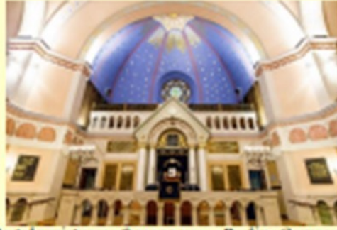
(Pestalozzistrasse Synagogue—Berlin, Germany)