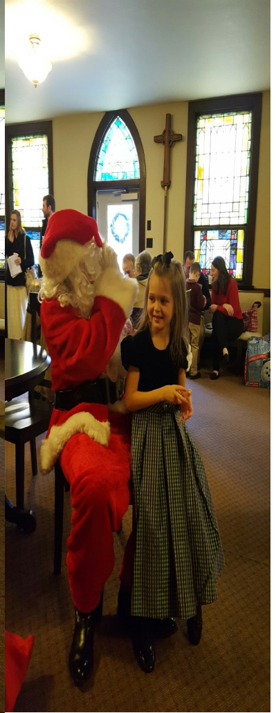
Santa stopped by Mars UP Church