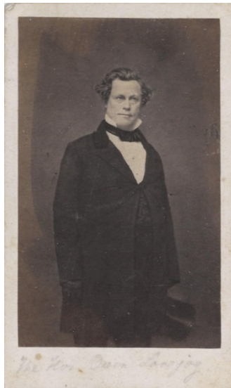
Owen Lovejoy, Brother of Elijah, and Friend of Lincoln (1811-1864)

Calhoun is right in his belief that anti-slavery sentiment is growing in the North, but voicing anti-slavery rhetoric is a far cry from espousing abolition. From Boston to Cincinnati those wishing to free all slaves and welcome them into their society are met with open and often violent resistance.