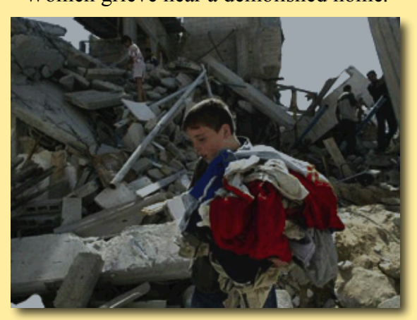
A child gathers clothing from the ruins.

International law forbids an occupying power from moving its own people into areas it occupies. Yet Israel has moved more than half a million of its own citizens out of Israel into the occupied West Bank, taking land, resources and water from Palestinians.