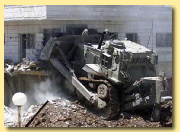
Caterpillar bulldozers destroy homes.