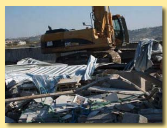
Caterpillar clears land for new settlements.