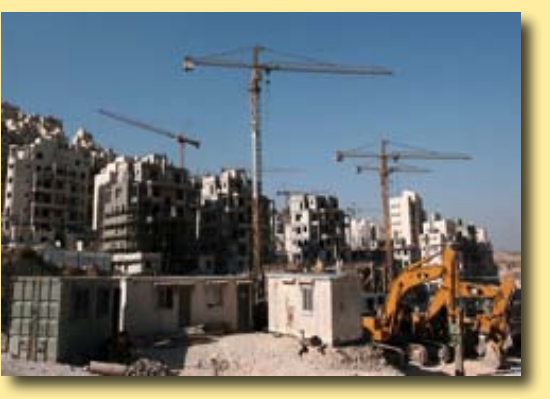
Caterpillar equipment builds settlements

United Methodist boards and agencies have been engaged in shareholder advocacy with Caterpillar, Motorola Solutions and Hewlett Packard Company for years without any meaningful progress. These companies continue to profit by equipping the illegal occupation. It is time for the United Methodist Church to cut its ties with these companies until they end their support of the occupation which our church clearly opposes.