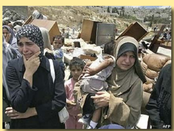
Women grieve near a demolished home.