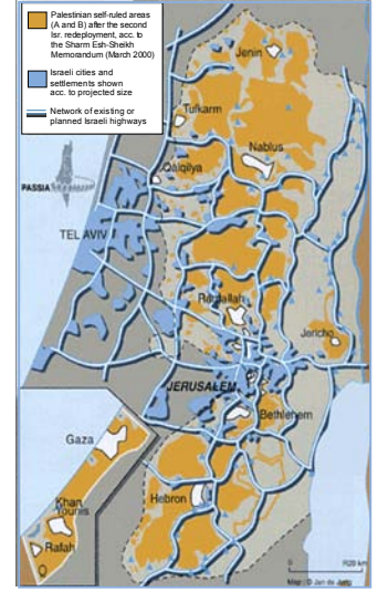
West Bank map: Segregated settlements and roads confiscate land and isolate Palestinians. Pale

These Israelis live in segregated settlements linked by segregated roads that have been built on Palestinian land.