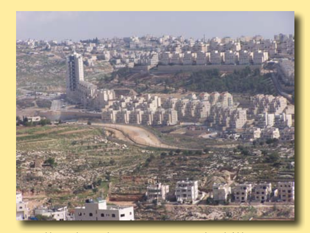
Illegal settlements cover the hilltops.