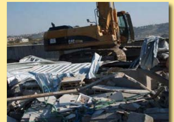
Caterpillar clears land for new settlements.