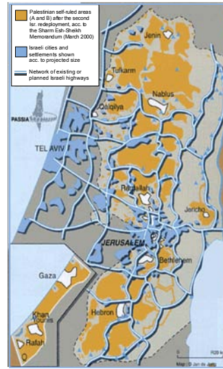
West Bank map: Segregated settlements and roads confiscate land and isolate Palestinians. Pale

The expansion of illegal settlements, confiscation of Palestinian land and demolition of Palestinian homes violate human rights and stand in the way of peace.