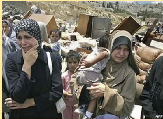
Women grieve near a demolished home.