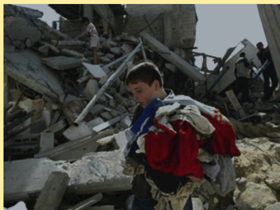
A child gathers clothing from the ruins.

International law forbids an occupying power from moving its own people into areas it occupies. Yet Israel has moved more than half a million of its own citizens out of Israel into the occupied West Bank, taking land, resources and water from Palestinians.