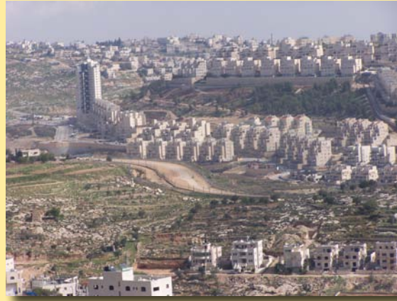
Illegal settlements cover the hilltops.