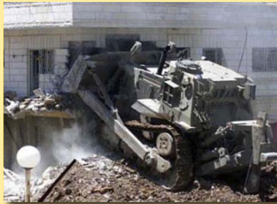
Caterpillar bulldozers destroy homes.