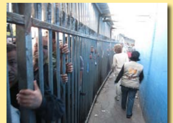
Palestinians wait at HP-equipped checkpoint.