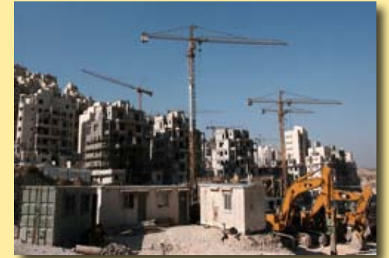
Caterpillar equipment builds settlements.

United Methodist boards and agencies have been engaged in shareholder advocacy with Caterpillar, Motorola Solutions and Hewlett Packard Company for years without any meaningful progress. These companies continue to profit by equipping the illegal occupation. It is time for the United Methodist Church to cut its ties with these companies until they end their support of the occupation which our church clearly opposes.