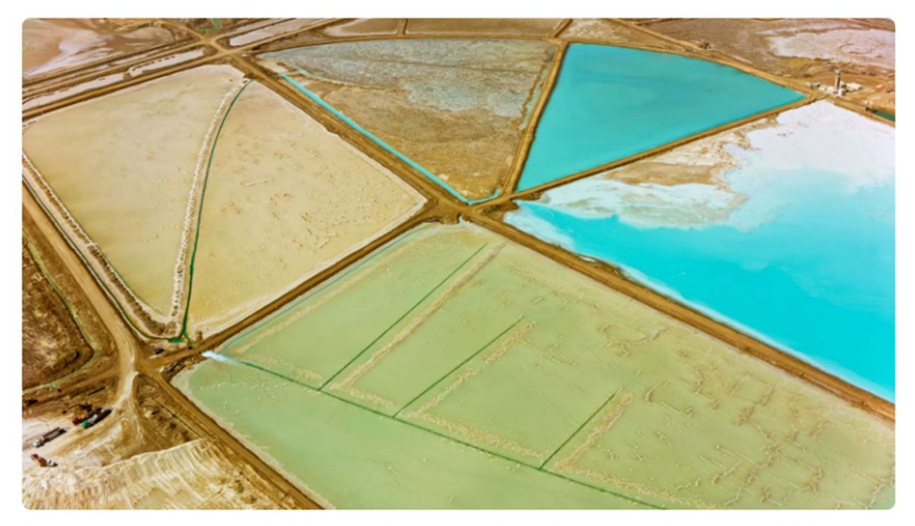
An aerial view of the Silver Peak Lithium Mine in Silver Peak, Nevada. The facility is the U.S.' lone lithium producer.