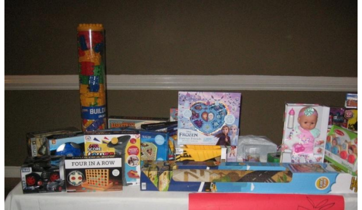
Toys for Tots