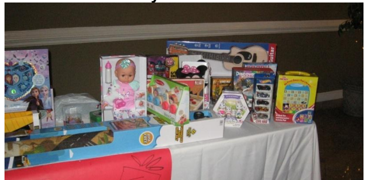
More Toys for tots