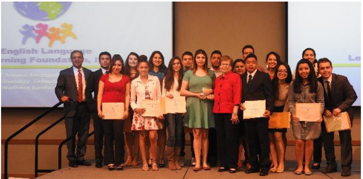
9th Annual Recognition Breakfast