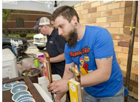
Beer Lingual Block Party