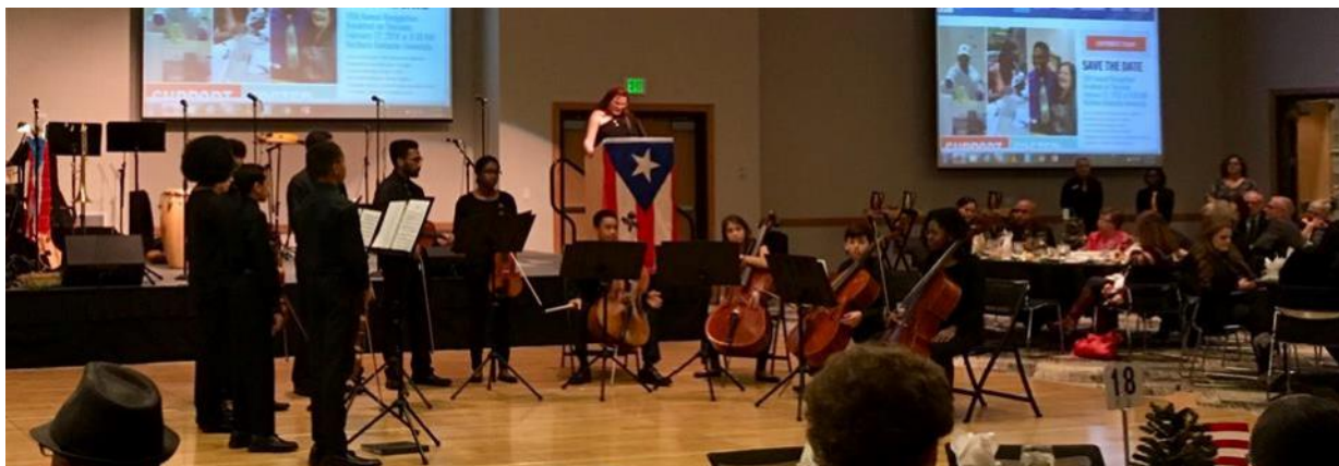
Puerto Rico Benefit Dinner