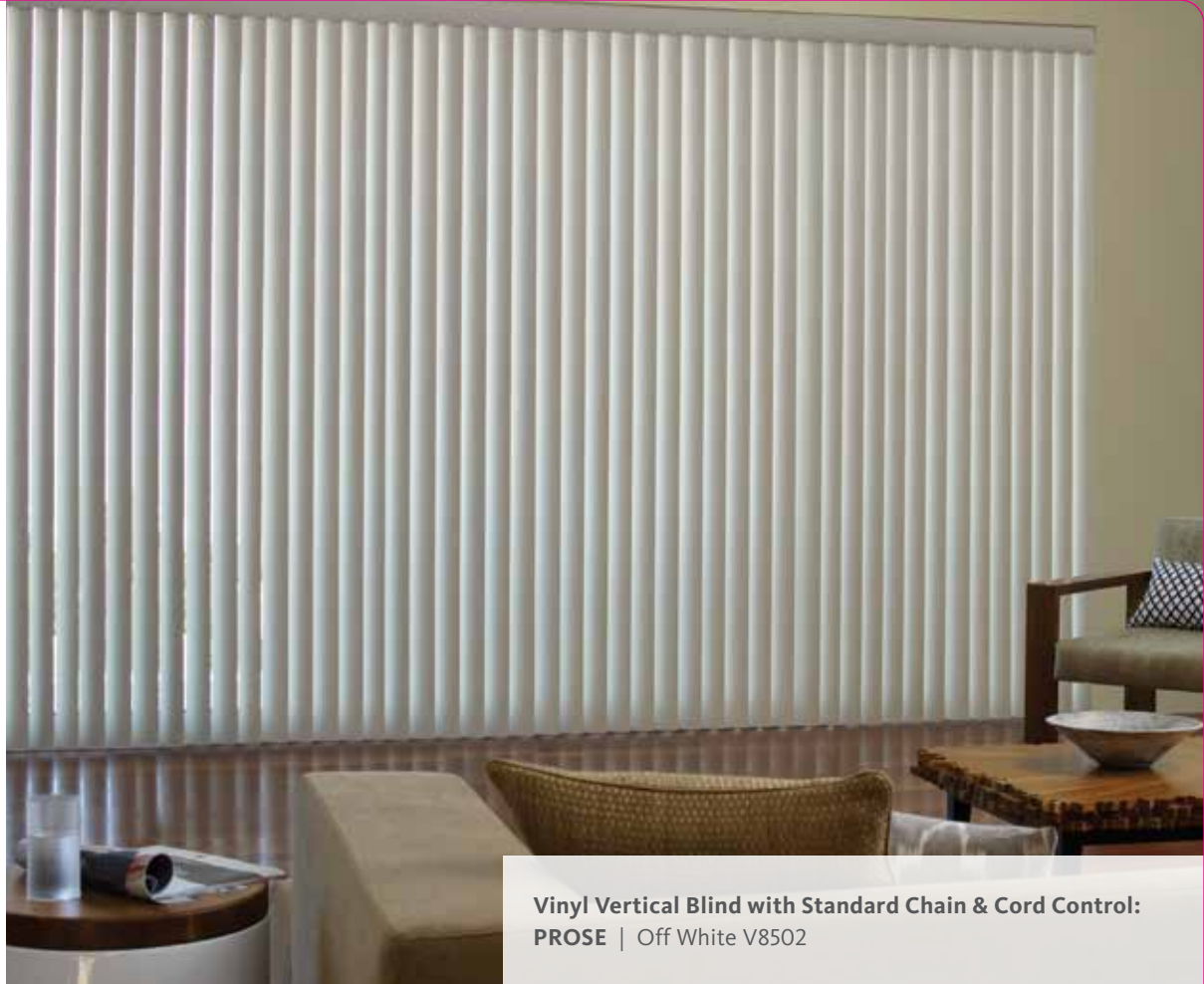
Vinyl Vertical Blind with Standard Chain & Cord Control: PROSE | Off White V8502

The latest hip hotel? Nope, your house. The cool lines of our vertical blinds collection serve up the ultimate in cost and energy efficiency with some of the most contemporary colors around. Accentuate the positive.