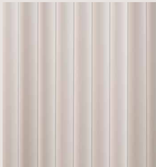
Groovers appear a neutral shade from the exterior.