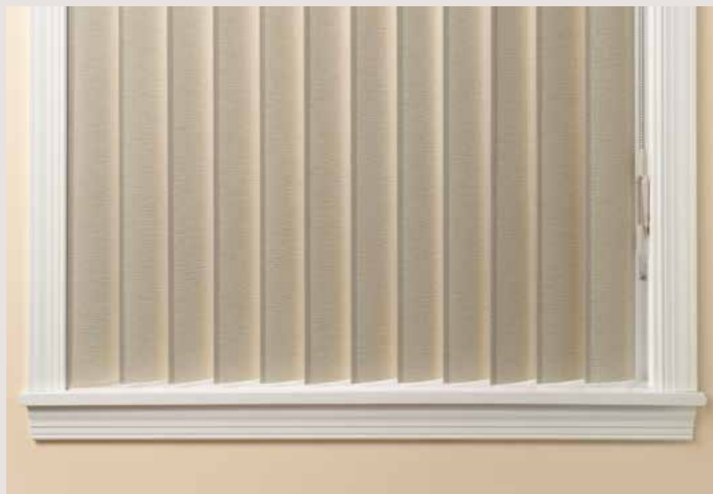
Fabric color and texture is visible from the interior.

The insert groover lends a neutral, uniform appearance from the outside. Available in white and ivory, the groover edges are guaranteed to remain clear for the lifetime of the vertical blind.