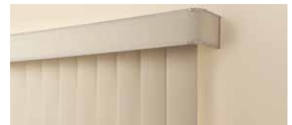
outside mount with valance returns