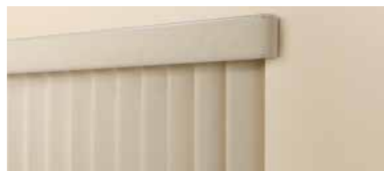
inside mount with valance returns