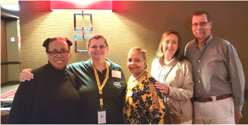
Tri-State Convention-South Carolina, North Carolina, Georgia