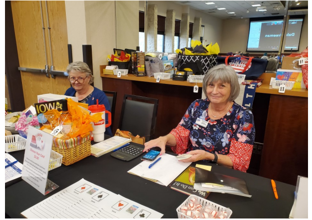
Iowa State Convention