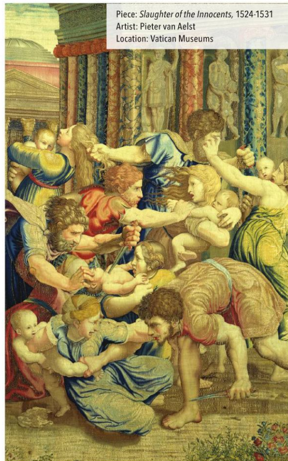
Piece: Slaughter of the Innocents , 1524-1531 Artist: Pieter van Aelst Location: Vatican Museums