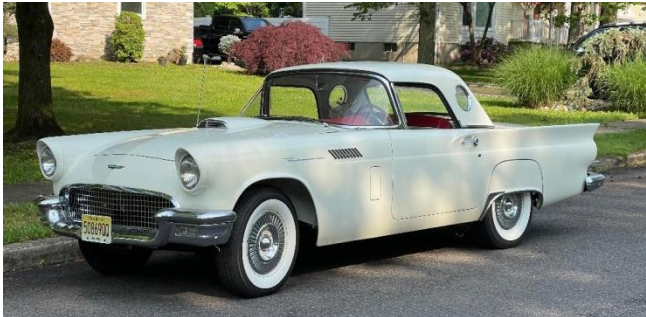
Tom Brieva's white 57 (See page 7)