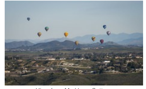
View from Markham Cottage

Residency Information Cottage Availability