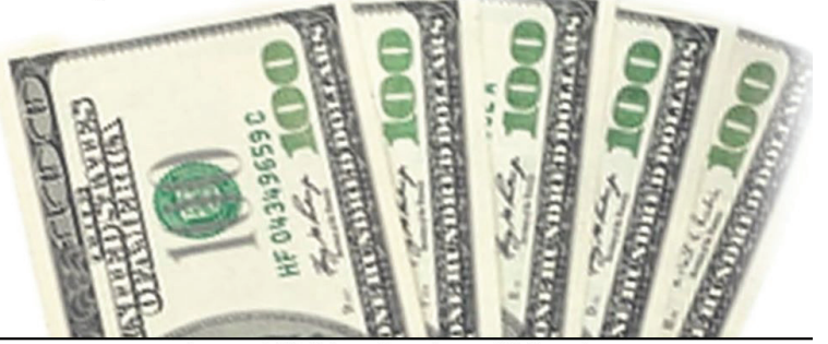
$50 each if didn't show in qualifying class Winning entry must have signed entry blank & entered by March 24, 2023 www.jdmasseyclassic.com

$100 to the Trainer and $100 to the Owner