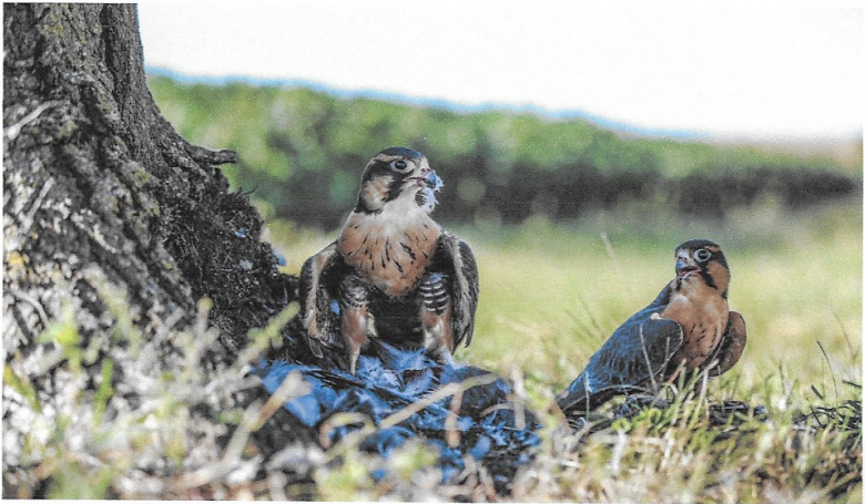
THE APLOMADO FALCON