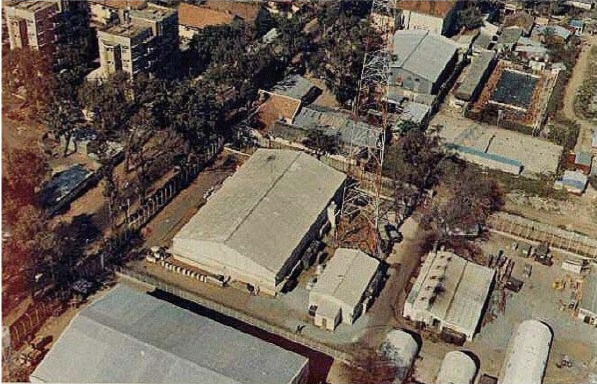
Aerial shot of Headquarters, AFVN, Saigon at #9 Hong Thap Tu.