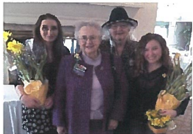
2015 Annual Meeting Minutes - page 3 of this newsletter