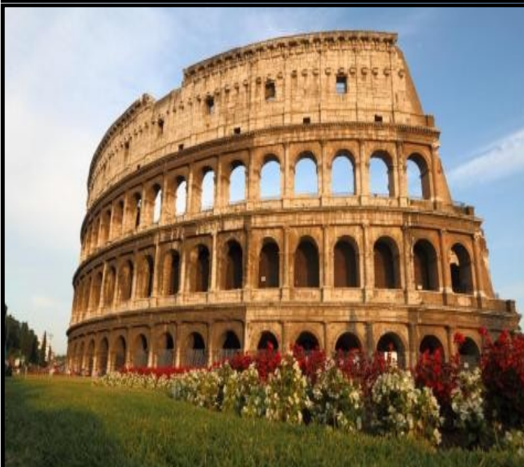
Back to Our Roots