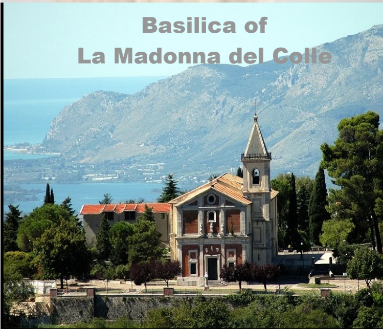
Basilica of La Madonna del Colle

Highlights: Florence / Tuscany / Wine Tasting / Verrazzano Castle / Truffle & Wine Pairing / San Gimignano / Perugia / Perugina Chocolate Factory / Rome Vatican Tour / Monumental & Ancient Rome / Lenola / Terracina & Feast of La Madonna del Colle