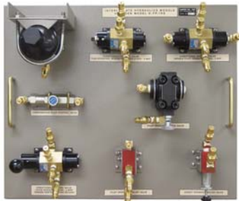
MODEL H-FP/IHS Intermediate Hydraulics