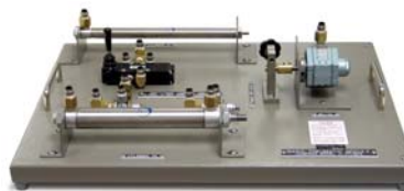
MODEL H-FP/BPS Basic Pneumatics