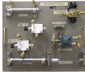
MODEL H-FP/BHS Basic Hydraulics