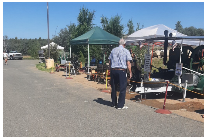
Mile High Club event at the Tractor Supply building in Prescott.